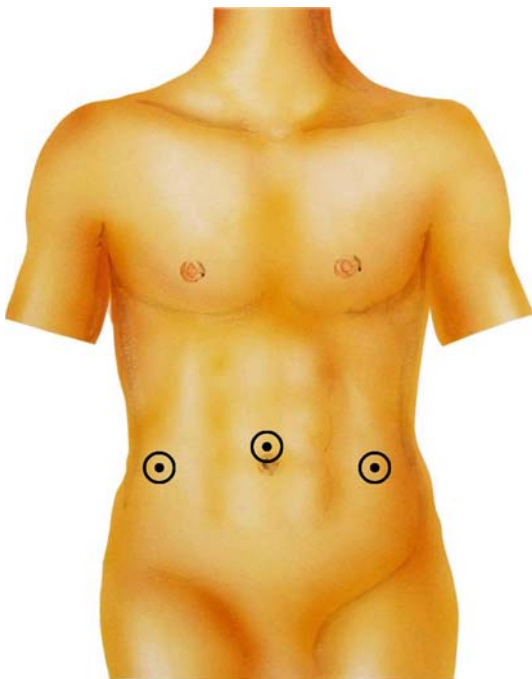
Figure 2. Trocar positions for a trauma laparoscopy.

Treatment depends on the equipment available in the respective hospital and the surgeon's experience. While simple lacerations of the intestine or mesentery can be sutured with monofile 3/0 thread, extensive deceleration injuries to the intestines can only be treated quickly and safely with the open technique. Minor injuries to the diaphragm can be dealt laparoscopically with sutures or suitable PTFE prosthetic material. Blunt abdominal trauma with active bleeding requires open surgery. In stable patients, sources of bleeding, either small vessels or such that have already ceased to bleed, can be closed with 3/0 monofile sutures or with modern coagulation devices (ultrasonic coagulator or LigaSure ® ). Large wound surfaces and lacerations of solid organs can be quickly and effectively sealed laparoscopically with fibrin adhesive (Figure 4) and tamponaded in combination with collagen fleece (Figure 5). Even with these adhesive and coagulative options, laparoscopy is not indicated for actively bleeding spleen and liver injuries. These injuries should only be treated laparoscopically when a primary laparoscopy has been undertaken for other reasons. In stable patients, liver and spleen injuries that do not show active bleeding upon CT are basically handled conservatively and not with surgery [9]. If laparoscopy is required to rule out intestinal injury, the measures mentioned above can be applied to prevent renewed bleeding.