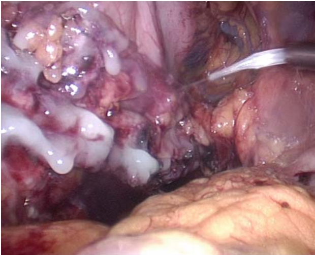
Figure 4. Laparoscopic treatment of a pancreas lesion using an autologous fibrin adhesive (Vivostat®).