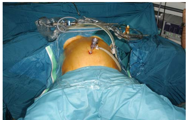
Figure 1. Patient’s position on the operating table for a trauma laparotomy or laparoscopy.

The abdomen is explored systematically, beginning with the right upper quadrant and proceeding clockwise. After a first fast survey, the exploration continues